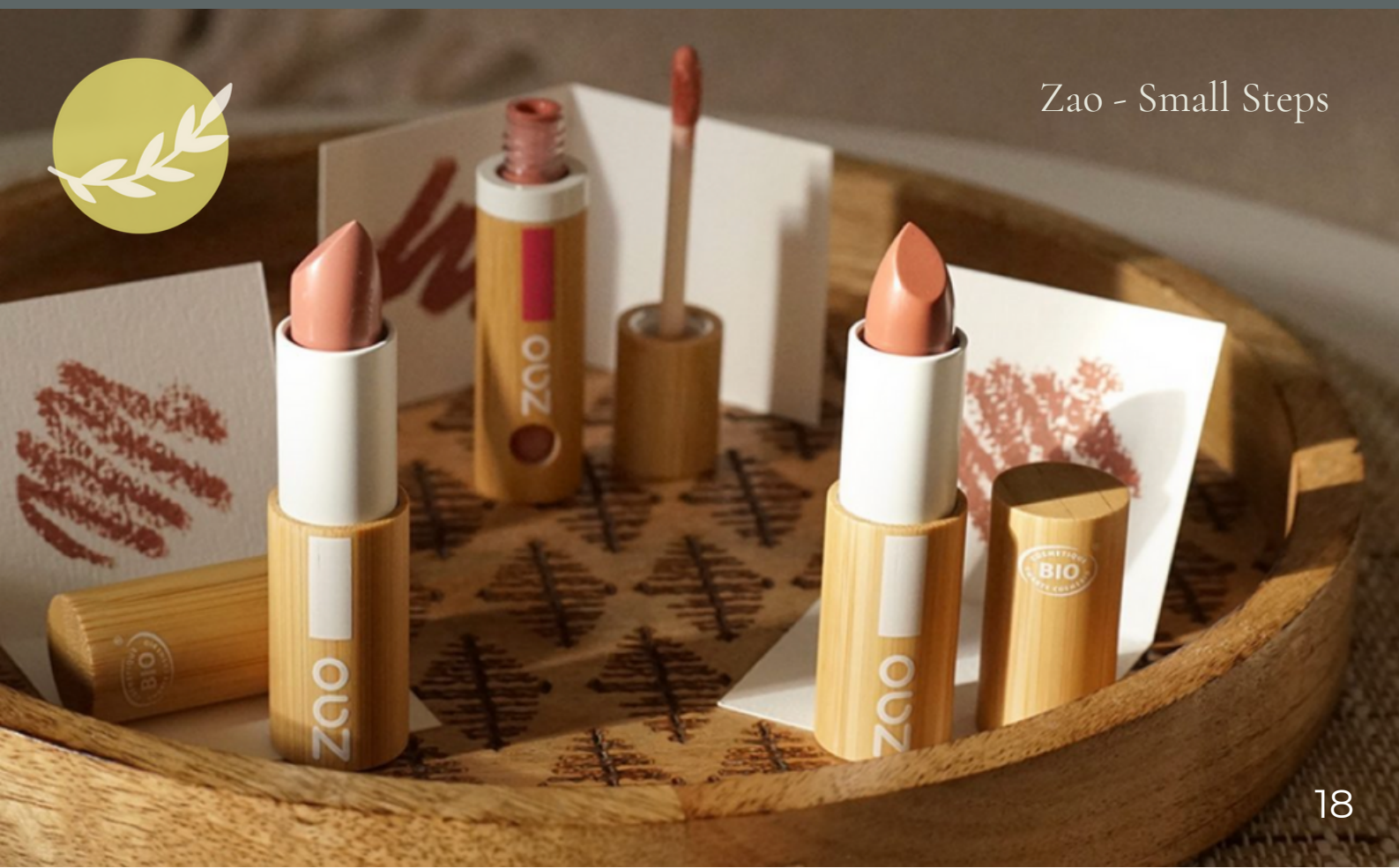
Zao - Small Steps

But for consumers, collating, comparing, and making decisions based on this information is a lengthy and time-consuming process, and not a realistic one for many. Our aim is to simplify this process, by encouraging companies to be transparent and doing the research for consumers.